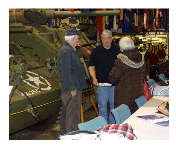
Everyone enjoyed the military displays