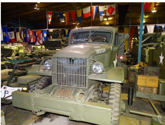
The museum chronicles the history of the jeep