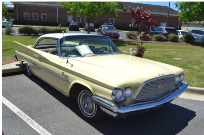
Terry Owen - 1960 Chrysler Saratoga