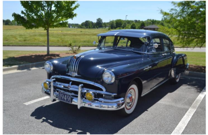
Frank Tatom - 1949 Pontiac