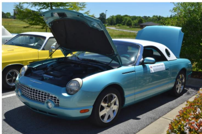
Dan Moore - 2002 T-Bird