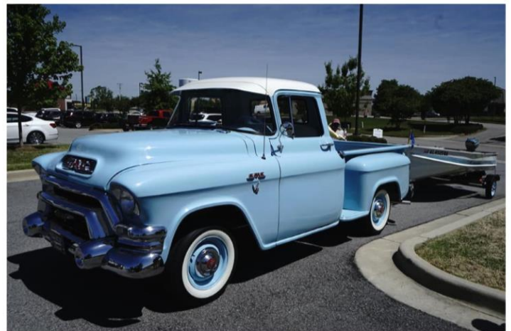
Tom Beam - 1955 GMC 100 Truck