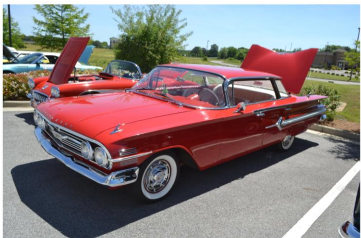
Mike Skelly - 1960 Chevy Impala