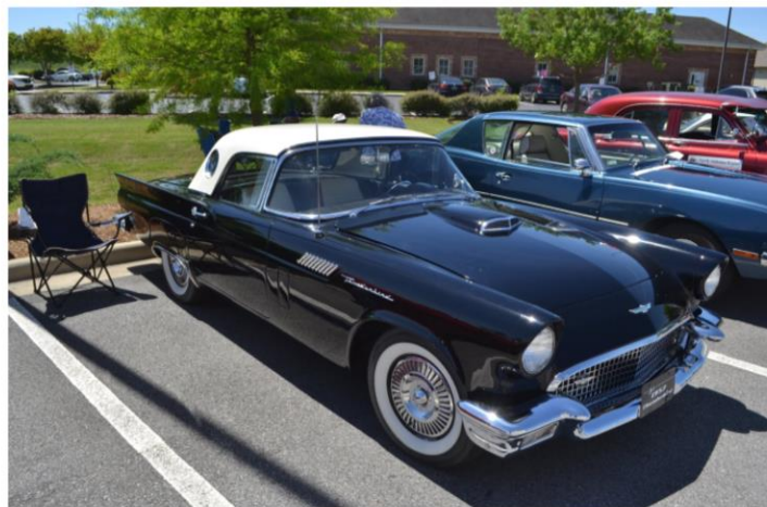
Chuck Knapp - 1957 T-Bird