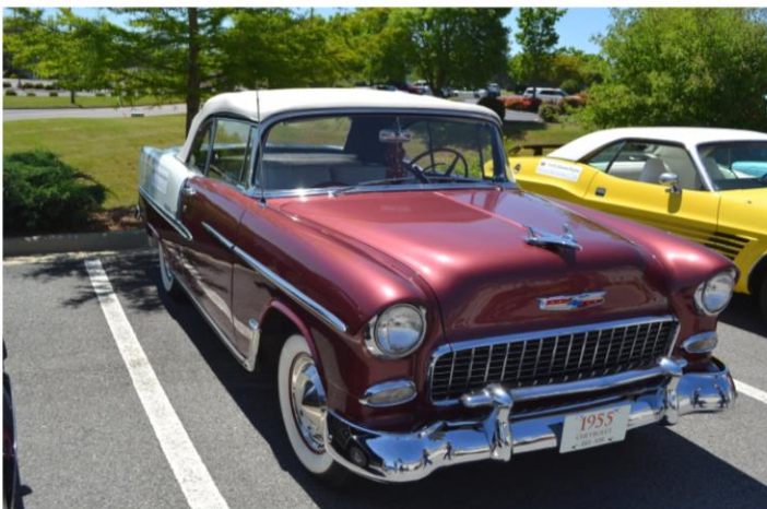
Jim True - 1955 Chevy Bel-Air Convertible