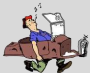
North Alabama Region

Spoke Folks is published monthly and is distributed to Region members and selected others. Non-copyrighted material contained herein may be reprinted if credit is given to Spoke Folks. Views expressed herein do not necessarily reflect the views of the Region Officers or the Board of Directors.