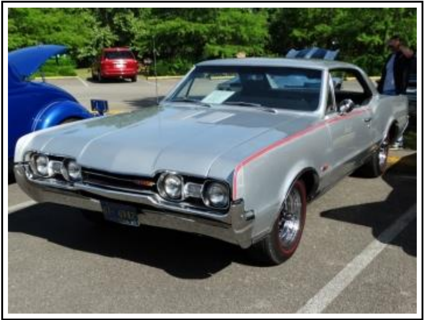
Dale Wright – 1967 Oldsmobile Cutlass 442