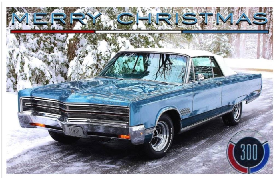
1968 Chrysler 300 Christmas Card

Automotive-themed Christmas cards were sent out in the early days in large numbers because this was a convenient way for the public to receive information highlighting new vehicles.