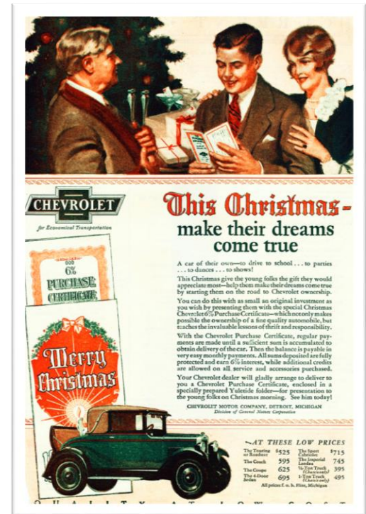
1927 Chevrolet Sport Cabriolet Ad

For example, Ford introduced its 1941 Lincoln models with a magazine ad saying "Give them a magic carpet for Christmas," featuring an image of Santa Claus with a 1941 Zephyr.