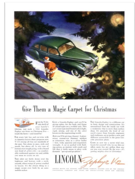
1941 Ford Lincoln Zephyr Ad