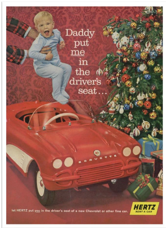
Hertz 1961 Ad

In conclusion, probably the most well-known and popular holiday automotive advertising featured Santa Claus driving or looking at the new vehicles. For many consumers who enjoy historic advertising, past holiday seasons were known for great automotive illustrations that became instilled in American culture and will be remembered for many generations to come.