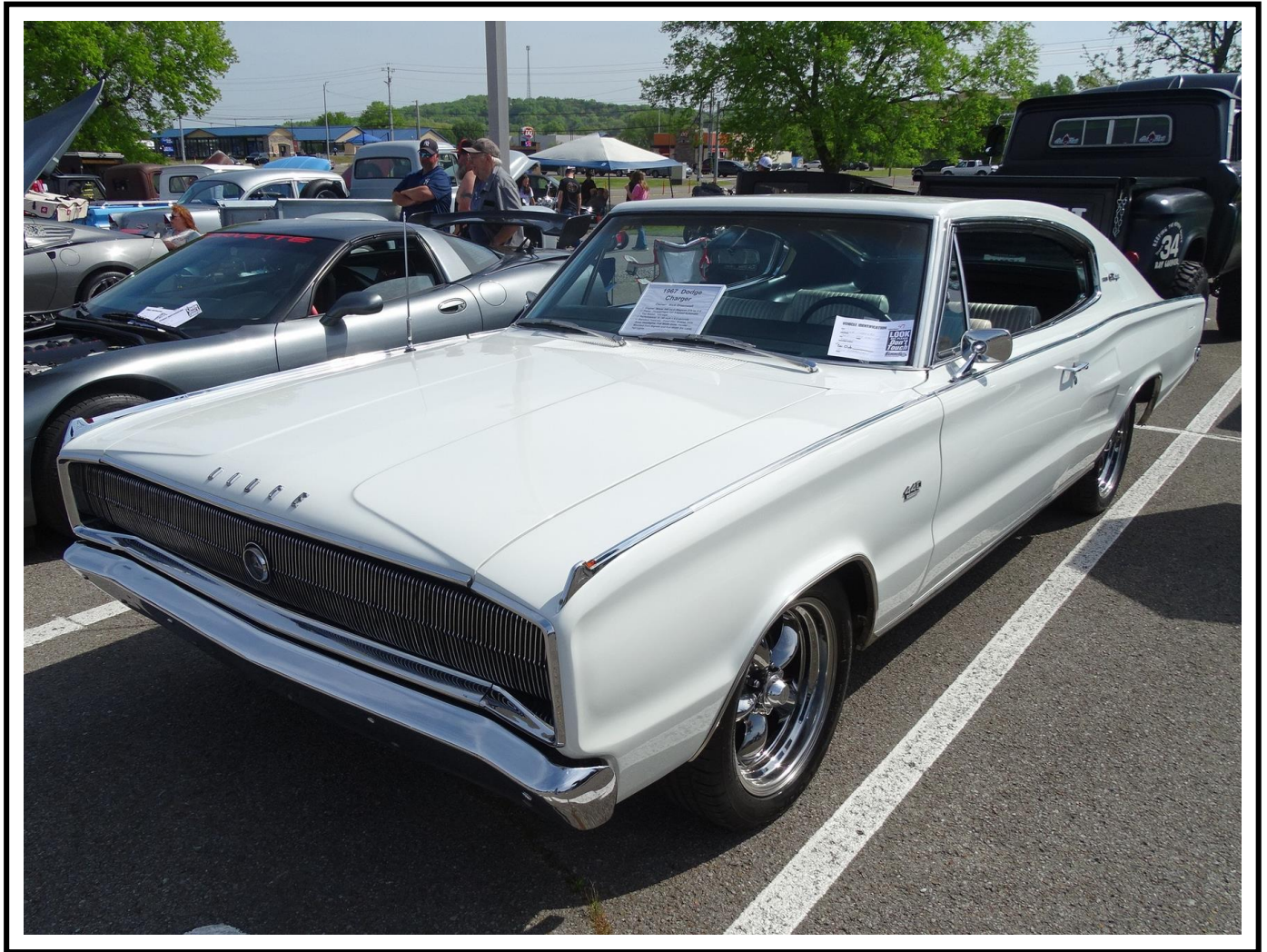
Rick Greenwalt 1967 Dodge Charger